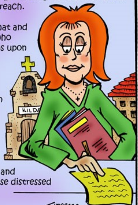
St. Brigid of Ireland

Her extraordinary spirituality, charity and compassion for those distressed were legendary.